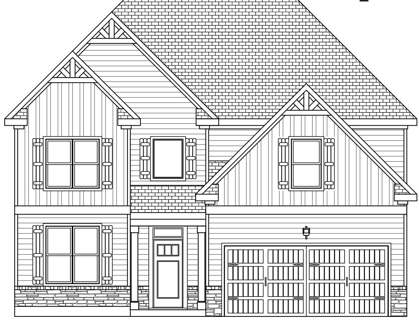
TOTAL 2,190 HSF